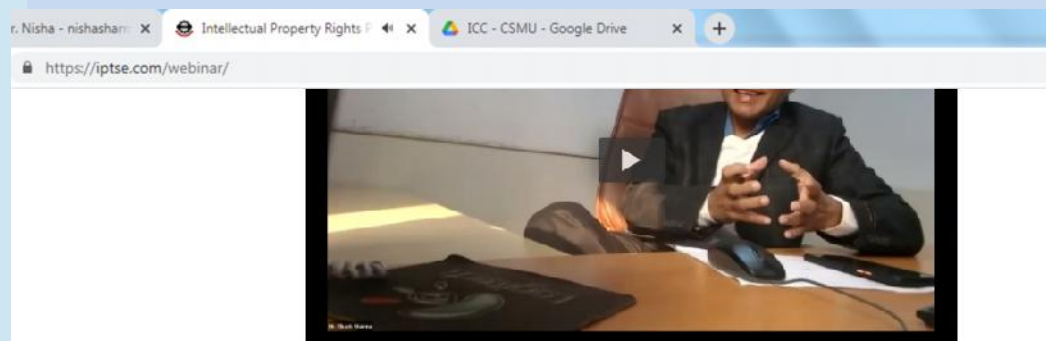
Patent Office Program On IP Awareness At CSJM University, Kanpur